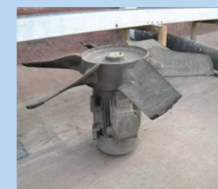
NEW HYBRID VENTILATOR (ECOPOWER EP600)