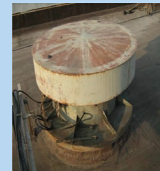
OLD AXIAL EXHAUSTER

Max. energy consumption of 116W typically consuming 90-100W