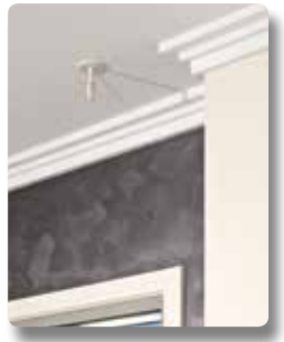
Internal sensor monitor