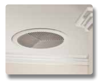
Easy to clean ceiling grill