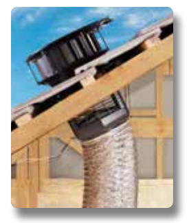
Ventilator head connected to the ceiling grille